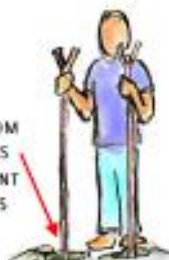
OIL BOTTOM OF STICKS TO PREVENT TERMITES