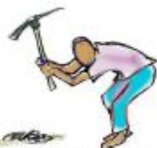
1. DIG TWO HOLES 18IN DEEP AND ABOUT 2FT APART