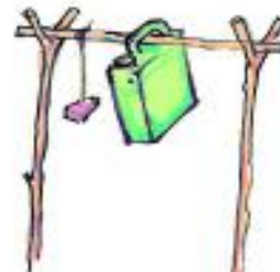
5. HANG CONTAINER AND SOAP ON CROSS STICK AND PLACE ON SUPPORTS.