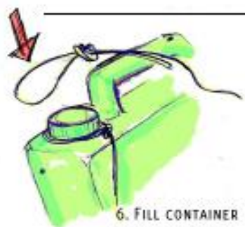
6. FILL CONTAINER WITH WATER AND ATTACH STRING.