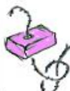
4. MAKE A HOLE IN THE SOAP AND THREAD STRING