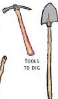
TOOLS TO DIG