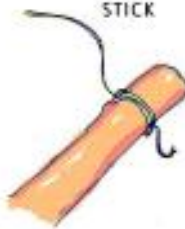
7. ATTACH OTHER END OF STRING TO FOOT LEVER STICK