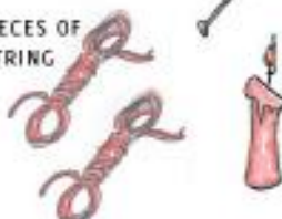
2 PIECES OF STRING