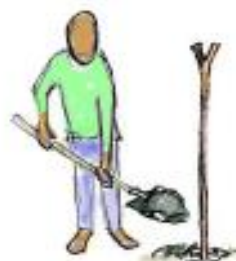
3. FILL HOLES WITH SOIL & ROCKS, AND PACK TIGHTLY